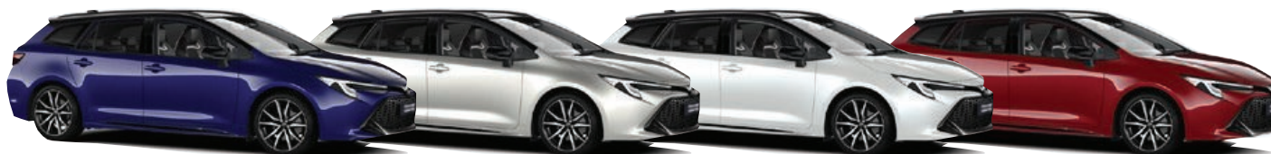
Juniper Blue Bi-tone (2VL)