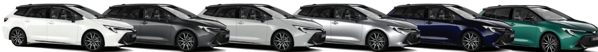
Pure White Bi-tone (2NR)