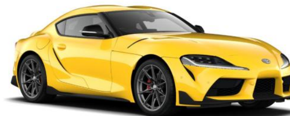
Lightning Yellow (D06)