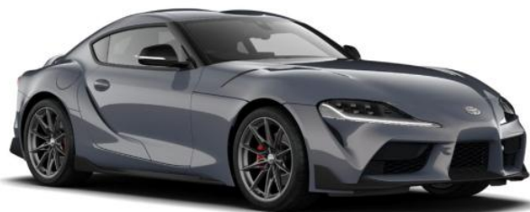
Sparkling Copper Grey(D03)