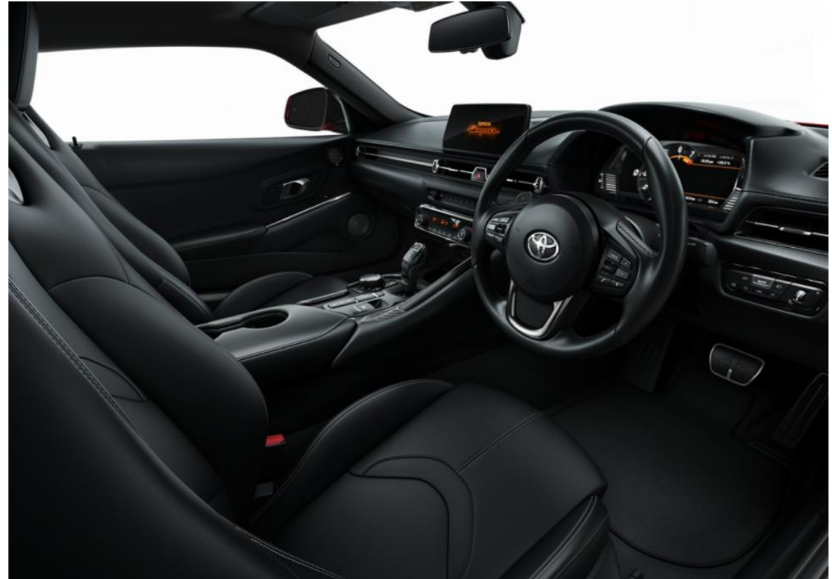
Black leather (LB20)