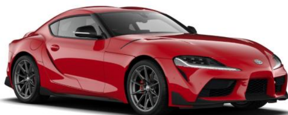
Prominence Red (D05)