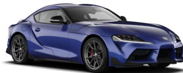
Portimao Blue (D13 )