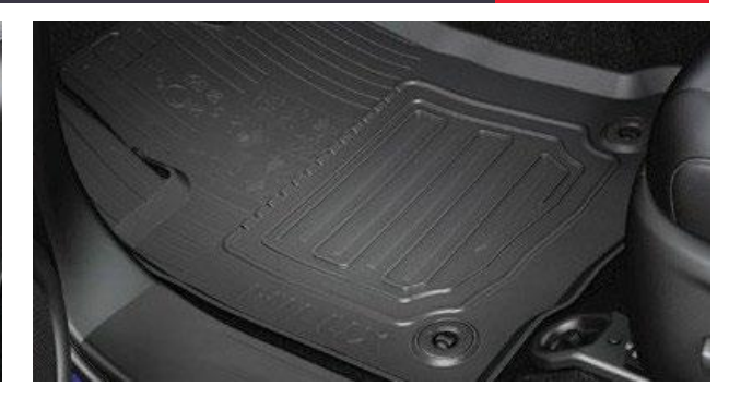
RUBBER FLOOR MATS Great looking, long lasting rubber floor mats to protect your car's cabin interior. Safety rings hold the driver's mat firmly in place.

Protect the tailgate inner surface from loading damage and general wear and tear with this tough liner.