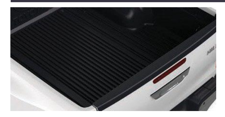
UNDER RAIL BED LINER Precision moulding for maximum load space,

Precision moulding for maximum load space, this polyethylene liner covers both the deck bed and side panels.