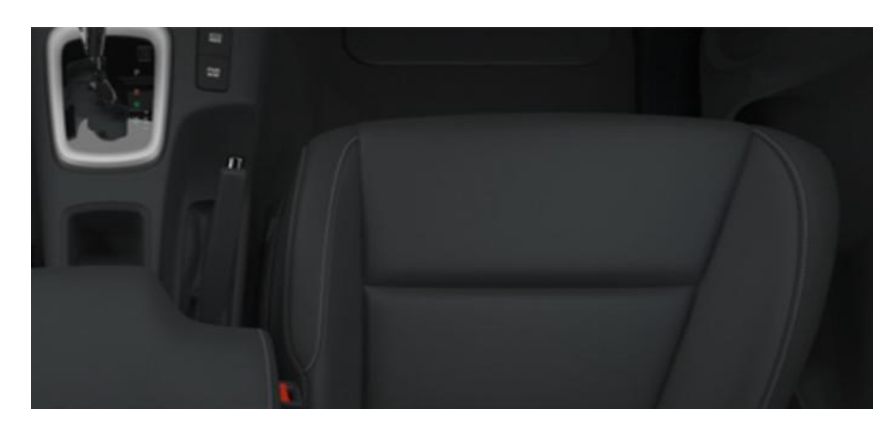
Black leather (LA20) * Only available on SR5 MHEV