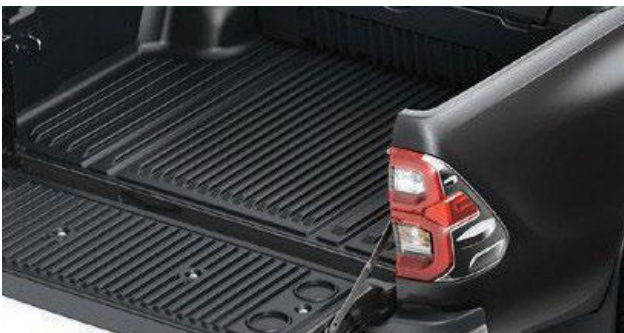
UNDER RAIL TAILGATE LINER

Precision moulding for maximum load space, this polyethylene liner covers both the deck bed and side panels.