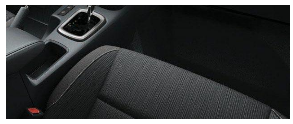
Black fabric with vertical pattern (FE20) SR5

A choice of two fabric and leather finishes are now available with a unified black instrument panel that delivers a fresh image.