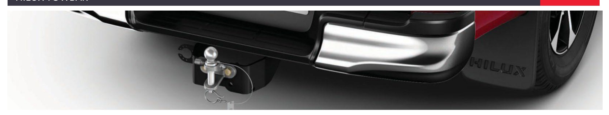
TOWBAR With its 3500kg capacity, a Toyota towing hitch gives you plenty of load carrying flexibility.