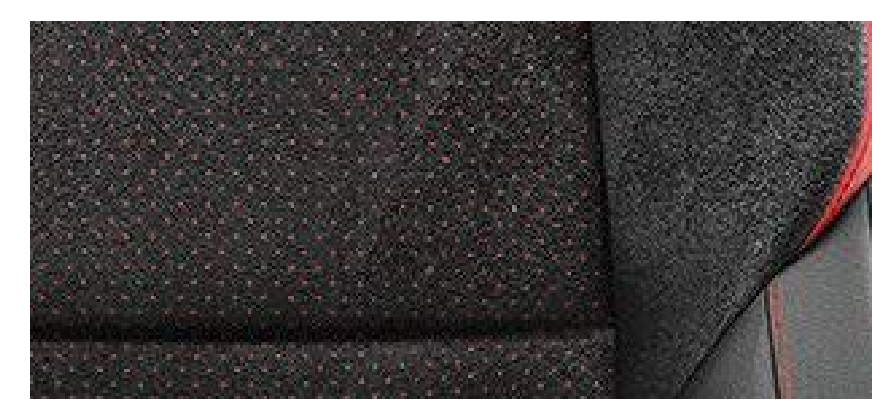
Black leather and synthetic suede (LG25) GR SPORT II