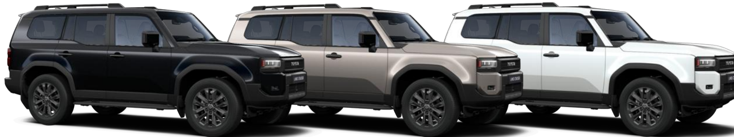
Attitude Black (218)