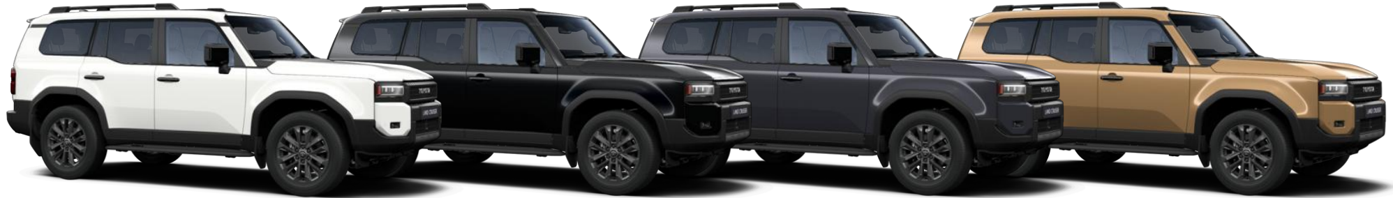
Pure White (040)