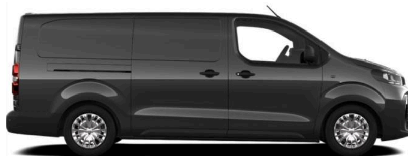
Titanium Grey (KKJ)