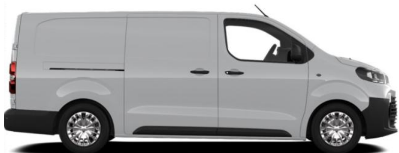
Icy White (EPR)