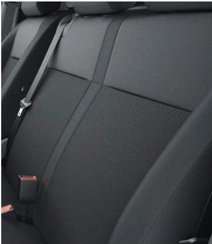
Dark grey fabric (43FT)

Available in dark grey fabric with a unified black instrument panel that delivers a fresh image.