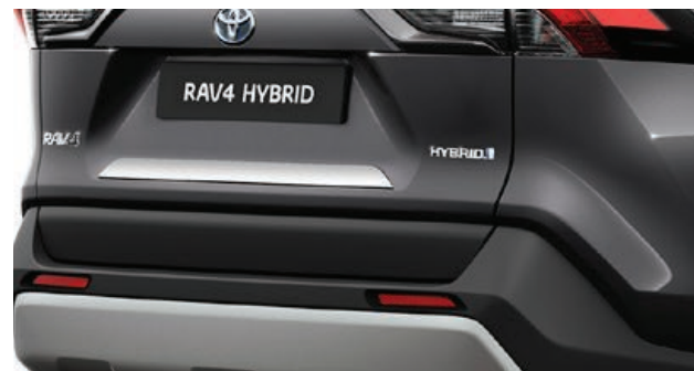
REAR GARNISH With a smart chrome finish to add an extra element of style to your car's boot.