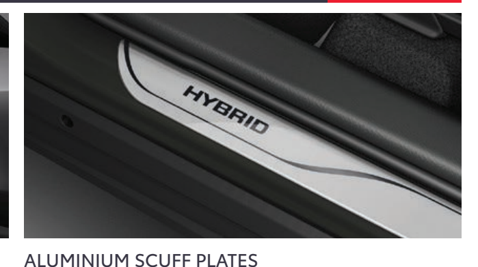
Genuine scuff plates for the door sills create an immediate impression of style while also serving a very practical purpose of protecting the sill paintwork.