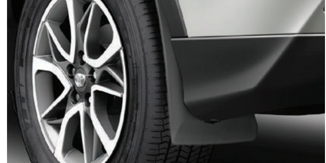
FRONT & REAR MUD GUARDS* Designed to minimise water, mud and stones spraying onto your car's body. *Cannot be fitted in conjunction with side steps.