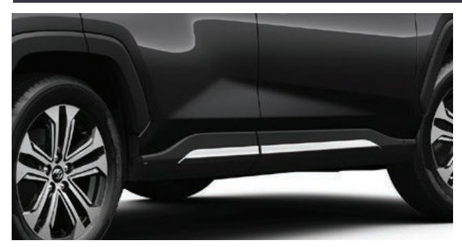
SIDE CHROME GARNISH Contoured to integrate smoothly with the side of your car and create a powerful low profile appearance.