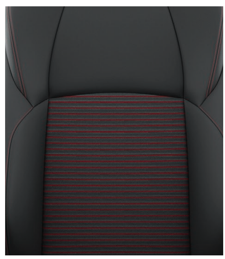
Black Synthetic Leather Upholstery with red stitching(Sol) Black Synthetic Leather Upholstery with red stitching (Sport) Full black Synthetic Leather Upholstery with silver stitching (GR SPORT)

Available in black synthetic leather a unified black instrument panel that delivers a fresh image.